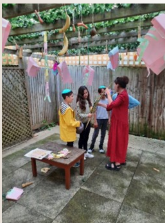
Learning in the Sukkah

Through a range of learning methods including classroom activities, guest speakers and field trips, the children in the Gan (Reception) - Vav (Year 6) classes look at all aspects of Jewish life. At this stage, the children acquire the basics of Hebrew language studies.