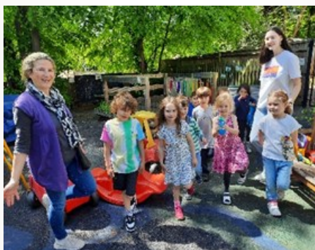
Learning about Torah in the sunshine

After a year of building a new Hebrew teaching program, we have developed it to fit the unique needs of our Cheder and community by creating original materials and activities as well as utilizing existing ones. We are happy to continue working with it and continue developing it to support and deepen the children’s knowledge and understanding of the language.