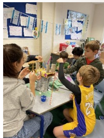
Making a model of the Temple