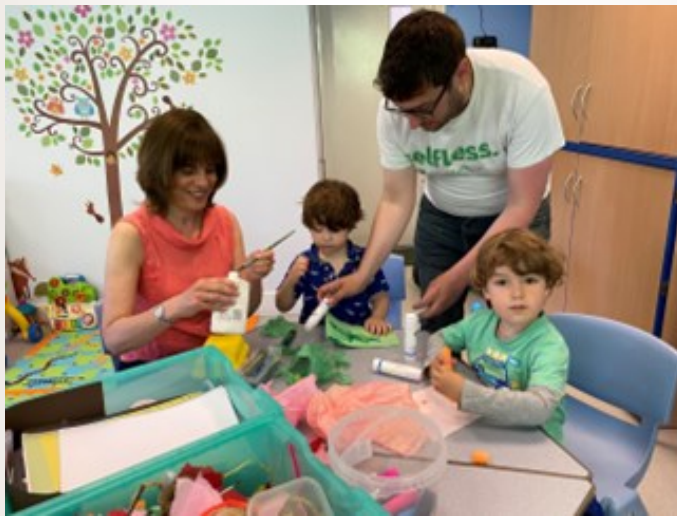
Fun in the Playshul

We believe that the best way to develop a strong Jewish identity is in an open environment that encourages tolerance and acceptance, and therefore we attach great importance to the value of interfaith in our school.