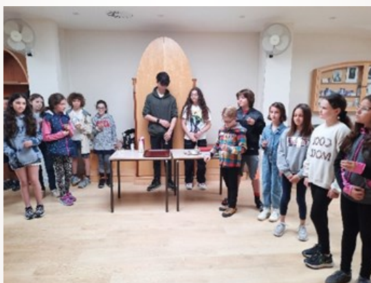
Senior classes making weekly Havdalah

Full Cheder policies covering Anti-Bullying, Behaviour and Child Safeguarding, as well as Health and Safety as it affects the Cheder, can be found on the Synagogue website www.wimshul.org under Education.