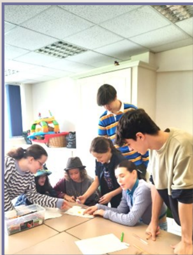
Hebrew lesson in the Vav class

Through a range of learning methods including classroom activities, guest speakers and field trips, the children in the Gan (Reception) - Vav (Year 6) classes look at all aspects of Jewish life. At this stage, the children acquire the basics of Hebrew language studies.