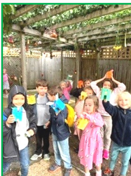
Enjoying decorating the Sukkah